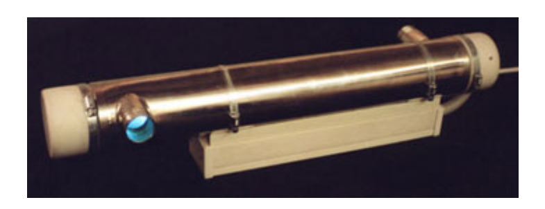
Lazur M-3 Unit

Lazur type units represent a new generation of devices for water disinfection derived from military technology. They demonstrate the capability to completely destroy pathogenic micro-organisms in water and transform toxic organic compounds into non-toxic neutral substances.